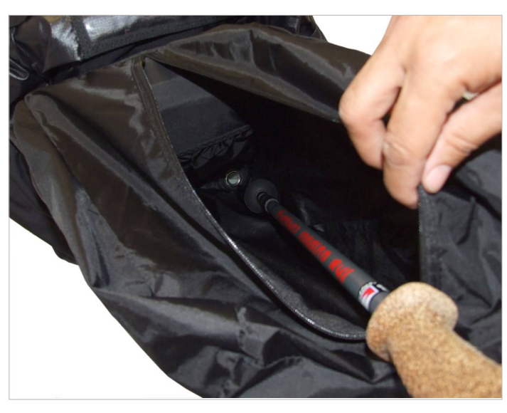
// Holder for telescopic trekking poles built into the rear pocket