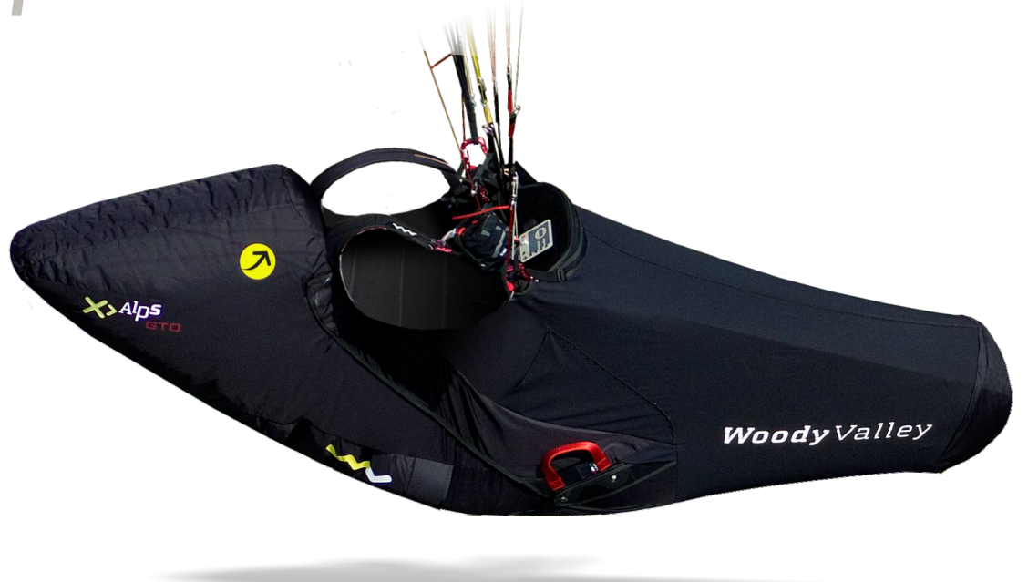
lightness sacrificing nothing