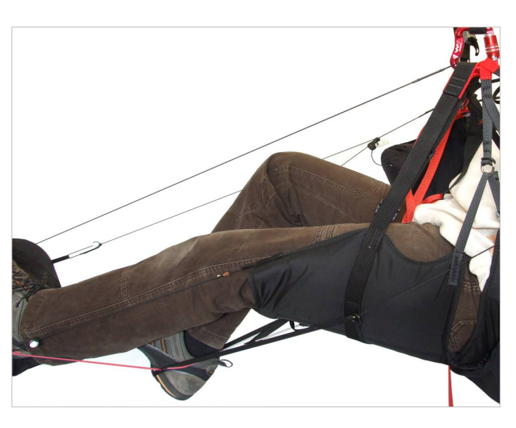
// Lightweight speed bar with three flexible steps