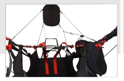
// Leg cover, adjustable in length with a range of 12 cm