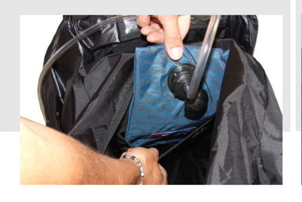
// Receptacle for hydration pack in the rear pocket