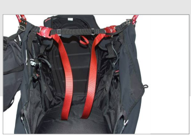
// GET-UP system with the innovative DRC anti-forget system