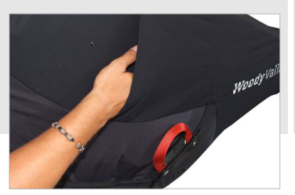
// Pockets accessible during flight