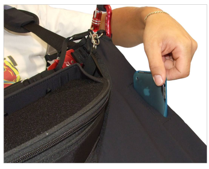
// Pockets accessible during flight